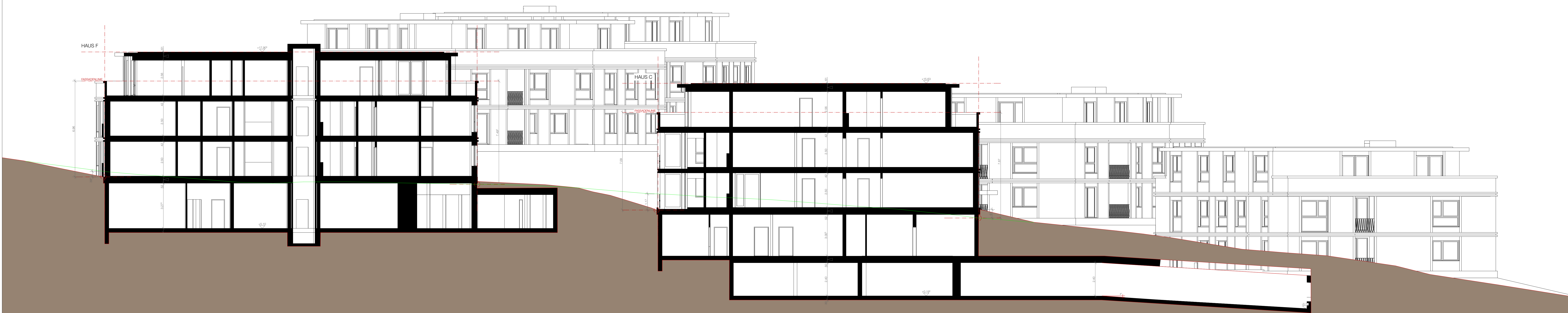
HAUS F + C